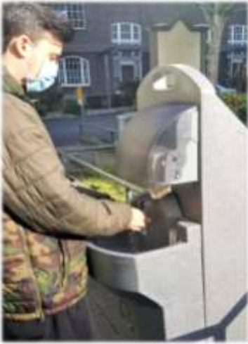
Washing hands before receiving food