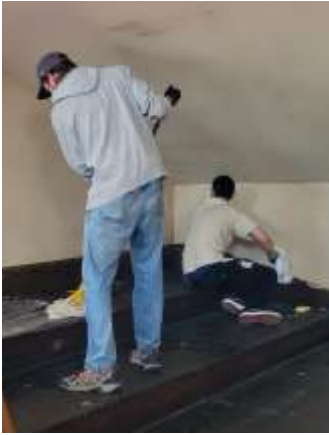
Helping out around the building