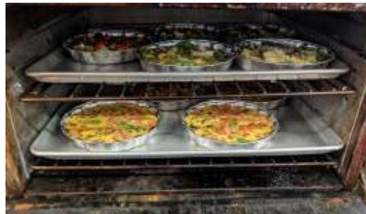
It's Quiche Day!