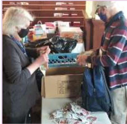
Volunteers packing post-vaccine care kits for our Hygiene Center guests