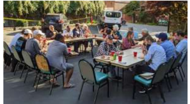
The return of Union Church Supper Club's monthly meal with the residents, July 2021