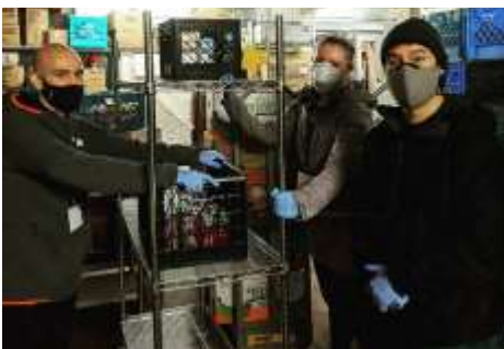
Martin Luther King, Jr. Day volunteers