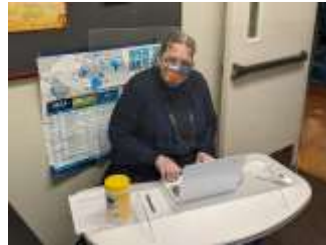
Food Bank Volunteer behind plexiglass checking-in visitors to shop!