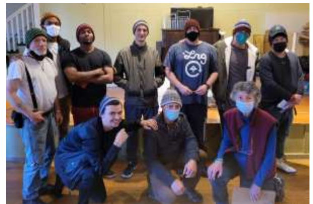
Shelter residents receiving new knitted hats from a thoughtful donor