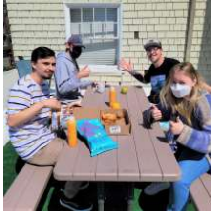
Enjoying a Spring picnic in our Covid patio while still in quarantine, April 2021