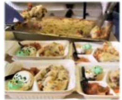
Serving lunch in To-Go Boxes