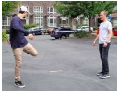
Playing hacky sack - enjoying the last burst of summer, Sept 2021