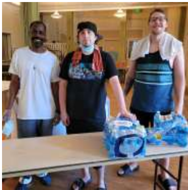
On Water Duty—Handing out bottled water to Food Bank guests during the heat wave, June 2021