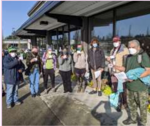
Staff receiving the first dose of the covid-19 vaccine!