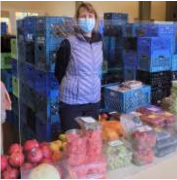
Food Bank Volunteer ready to serve health fruits & veggies!