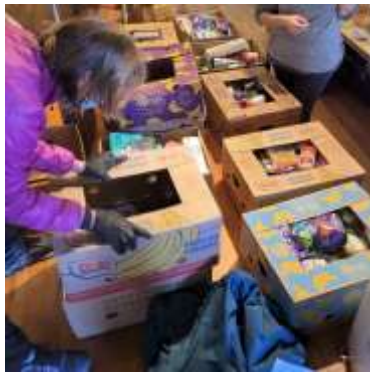
Food Bank Volunteer assembling Home Delivery Boxes

By the Numbers: 6,009 households served 8,827 individuals served 233,995 lbs. of food distributed 99 volunteers 1,601 home deliveries 373 new households served