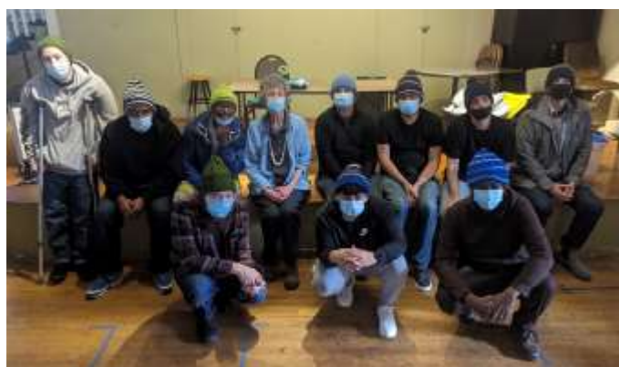
Sporting new knit hats from Marcy Golde