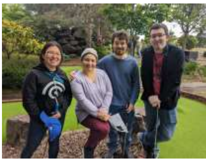
Another successful Putt-Putt